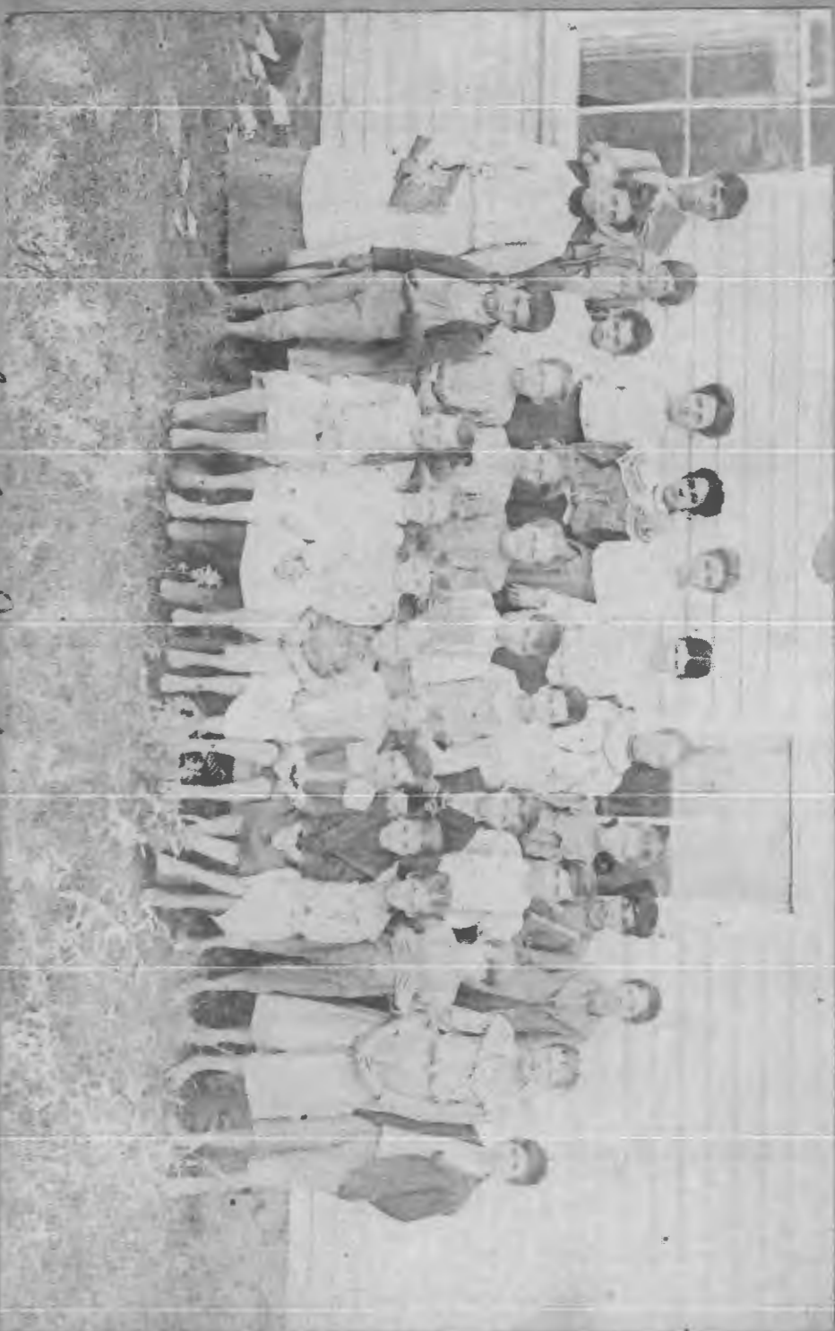
Now Sulphur School about 1914