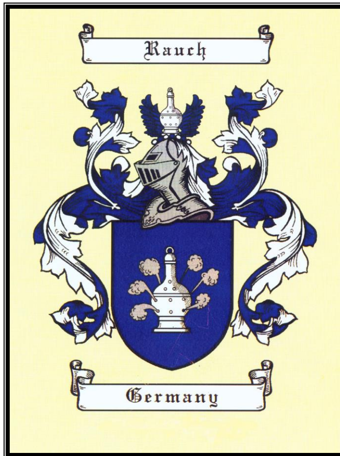
The Rauch Family Crest from Germany.