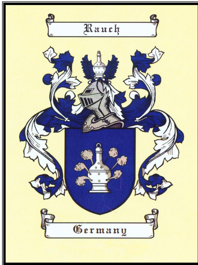
The Rauch Family Crest from Germany.